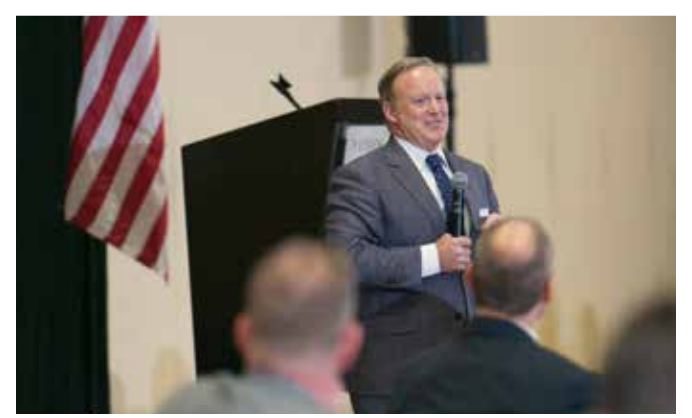
Keynote Speaker Sean Spicer