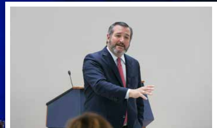
Senator Ted Cruz at NAPEO's lunch on Capitol Hill