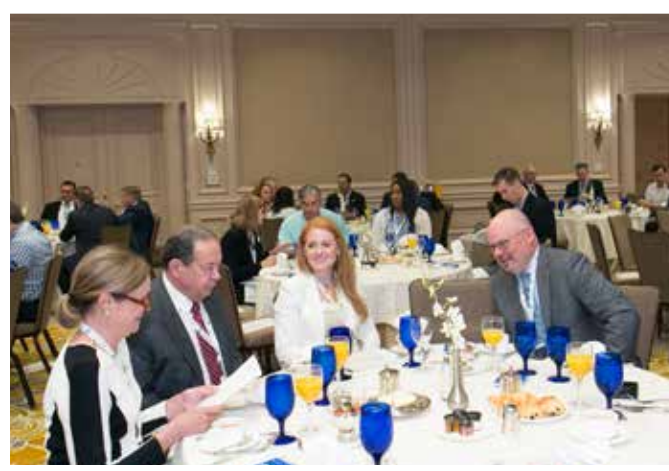
PEO Advocacy Day breakfast