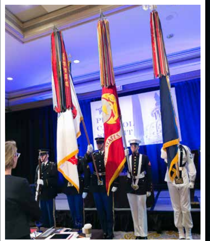
A military color guard opening the legal portion of the conference, a NAPEO tradition