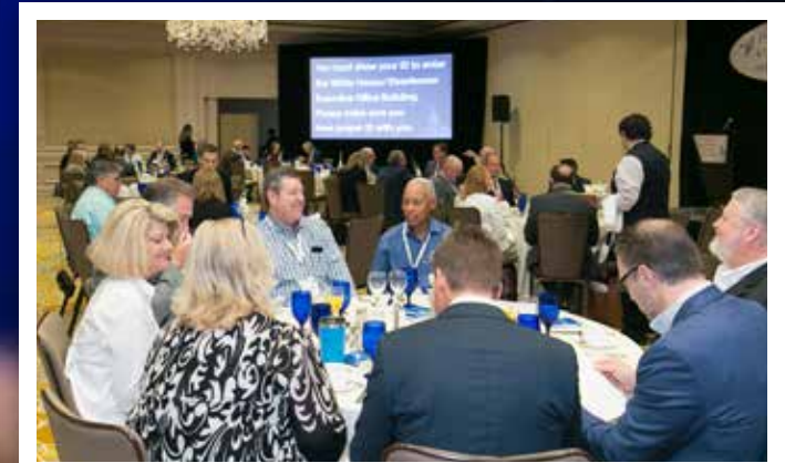
PEO Advocacy Day breakfast briefing