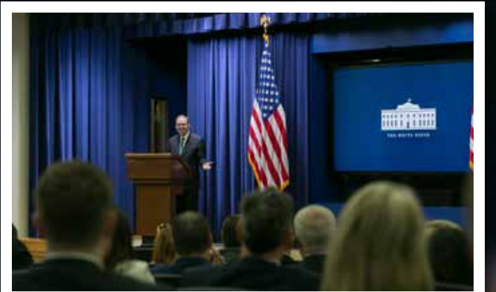
Kevin Hassett at NAPEO's White House briefing