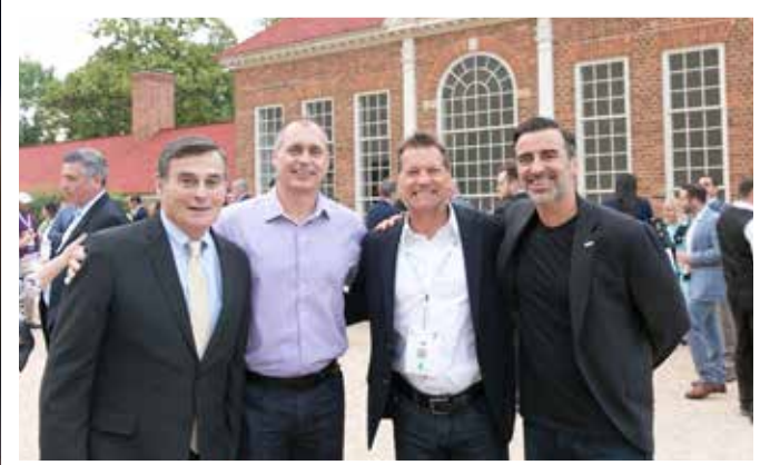
Mount Vernon by Evening