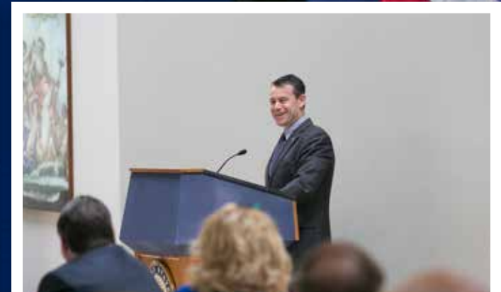
Senator Todd Young