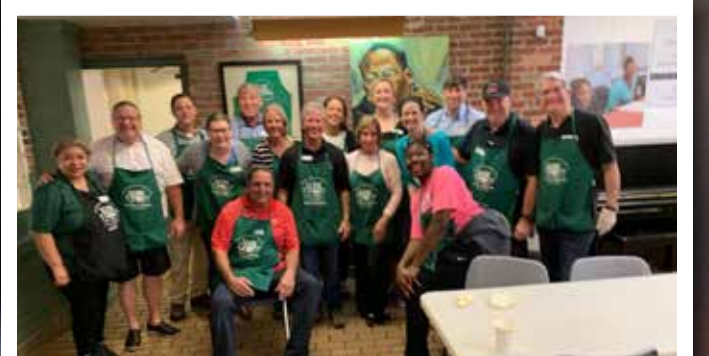
A group of NAPEO leaders served breakfast to homeless members of the community early Monday morning in collaboration with So Others Might Eat